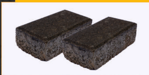
Brick Paver 200mm x 100mm (thickness - 60mm/80mm)