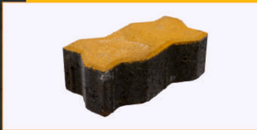
Unipaver / Zig-Zag (thickness - 60mm/80mm/100mm)