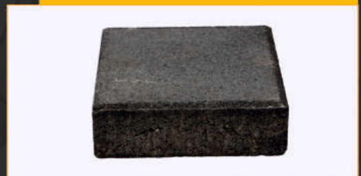
Square 150 x 150 (thickness- 60mm/80mm) 200mm x 200mm (thickness-60mm/80mm)