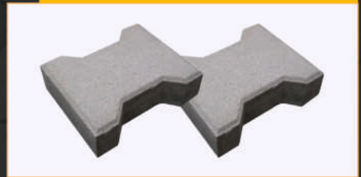
I - Shaped (thickness - 60mm )